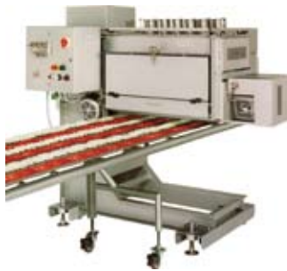
Fresh Produce Slicer