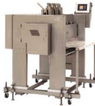
High Speed Slicer