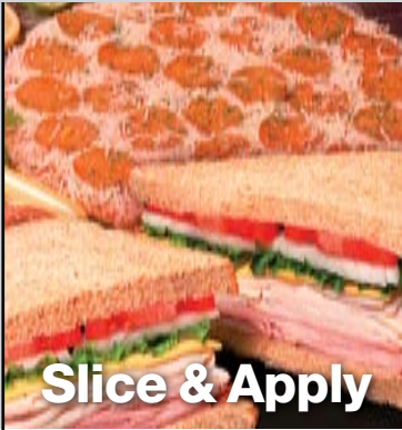
Slice & Apply